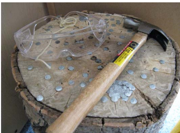
Safely using real materials allows children to feel powerful, respected and valued. Note the safety goggles used with the hammer and nails pictured above.