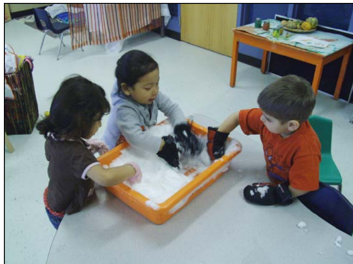
Relationships develop through joint experiences with a shared interest.