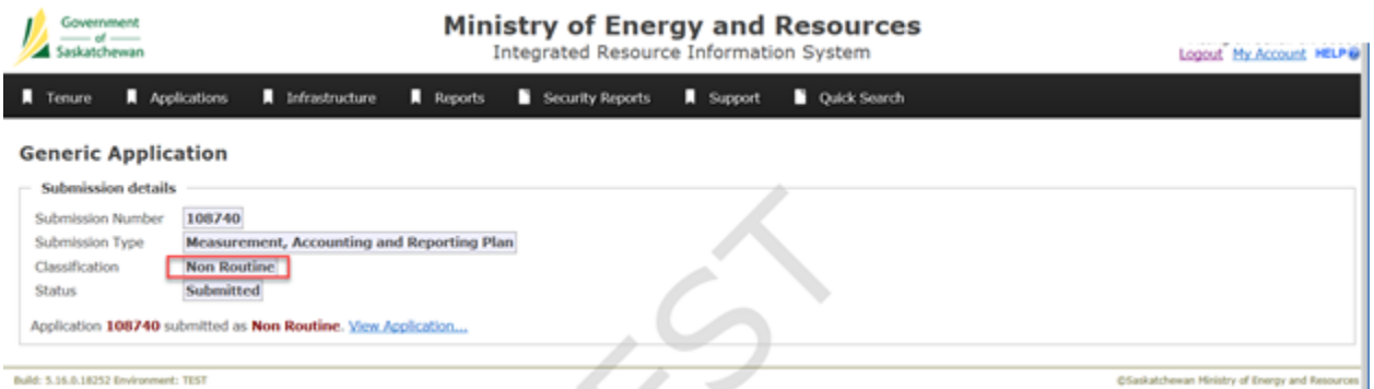
Figure 4: Submission Details Screen in IRIS

Step 5: The User will receive a submission number and the application classification type will be non routine which means the Ministry will review the application before approval. See Figure 4. Once the application is reviewed by the Ministry an approval or denial notice will be sent to the user who submitted the MARP.