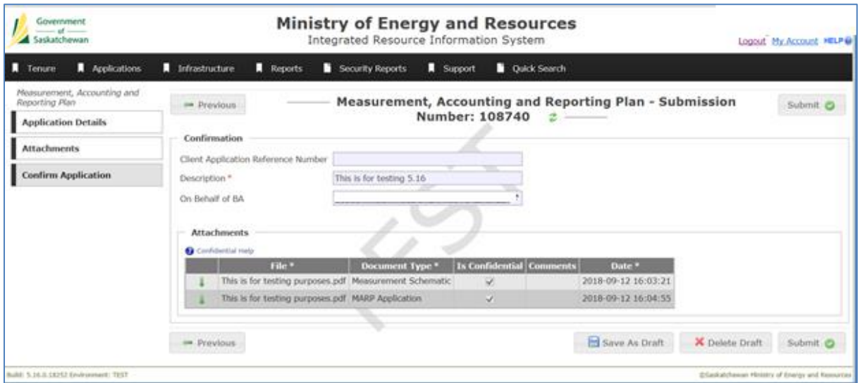
Figure 3: Confirmation screen for MARP Application Submission Screen

Step 5: The User will receive a submission number and the application classification type will be non routine which means the Ministry will review the application before approval. See Figure 4. Once the application is reviewed by the Ministry an approval or denial notice will be sent to the user who submitted the MARP.