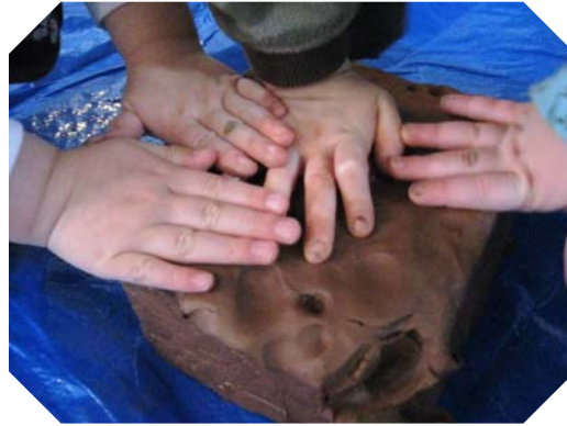
Providing real art materials such as paint and clay for children to explore