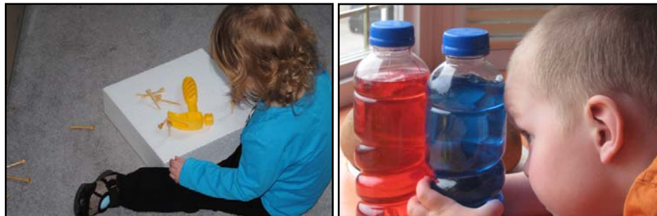
Provide children with numerous opportunities to touch, explore and manipulate (play with) different materials from an early age.

Recent brain development research has given us valuable information for working with young children. We now know that while the physical brain is developed at birth, the early experiences of children have a huge influence on brain development. Synapses are connections that form between neurons in the brain. Exploring new materials allows new synapses to form. These connections in the brain help various parts of the brain work together to process information more effectively and to derive meaning from the sensory experiences in which children take part. Repeated exposure to positive interactions and experiences builds stronger connections that can be maintained through life.