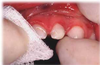
Dry teeth with a gauze.