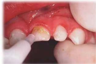
Paint fluoride varnish on teeth.