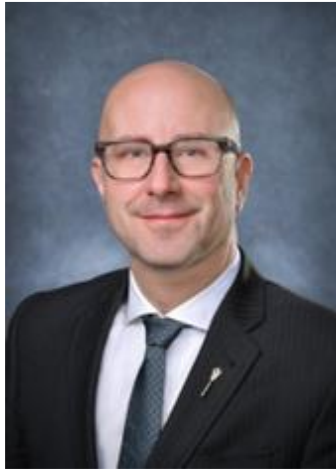
The Honourable Sean Wilson Minister of SaskBuilds and Procurement

I am honored to present the Ministry of SaskBuilds and Procurement's Business Plan for 2026–27.