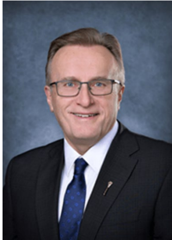
The Honourable Jim Reiter Deputy Premier and Minister of Finance

I am pleased to present the Ministry of Finance Business Plan for 2026-27.