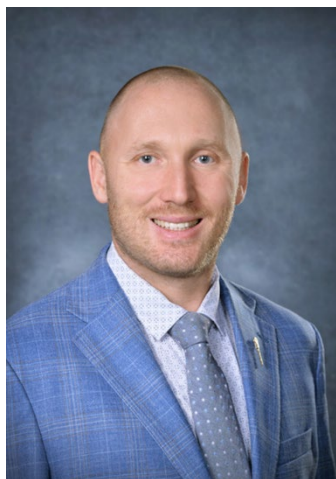
The Honourable Chris Beaudry Minister of Energy and Resources

I am pleased to present the 2026-27 Business Plan for the Ministry of Energy and Resources. The 2026-27 Budget continues to position Saskatchewan as a global leader in energy and resource development. We remain a trusted and reliable supplier at home and around the world, while pioneering innovative programs that shape the future of sustainable and responsible natural resource development.