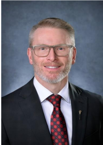
The Honourable Everett Hindley Minister of Education

It is a privilege to present the 2026-27 Ministry of Education Business Plan.