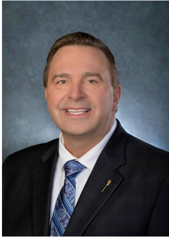
The Honourable Ken Cheveldayoff Minister of Advanced Education

I am pleased to present the 2026-27 Business Plan of the Ministry of Advanced Education.