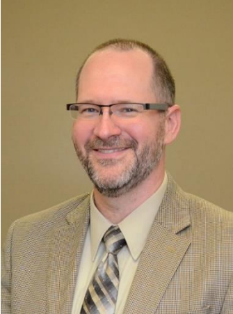
Clint Repski Deputy Minister of Education

The Honourable Everett Hindley Minister of Education