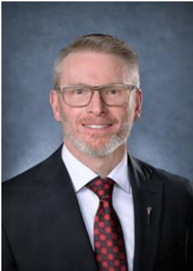
The Honourable Everett Hindley Minister of Education

Her Honour, the Honourable Bernadette McIntyre, Lieutenant Governor of Saskatchewan