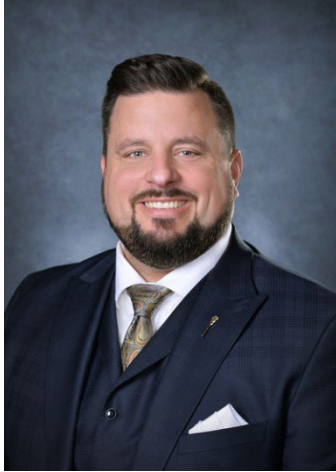
The Honourable Eric Schmalz Minister of Government Relations Minister Responsible for First Nations, Métis and Northern Affairs Minister Responsible for the Provincial Capital Commission

I am honoured to present the Ministry of Government Relations Business Plan for 2025-26.