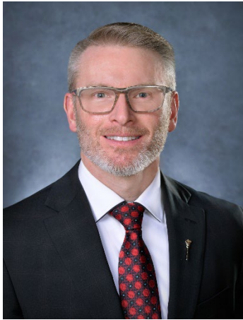
The Honourable Everett Hindley Minister of Education

I am honoured to present the 2025-26 Ministry of Education Business Plan.