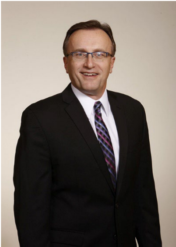
The Honourable Jim Reiter Minister of Energy and Resources

Office of the Lieutenant Governor of Saskatchewan