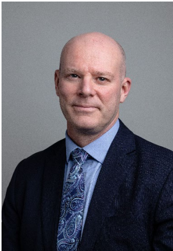
Blair Wagar Deputy Minister of the Ministry of Energy and Resources

The Honourable Jim Reiter Minister of Energy and Resources