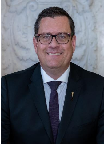
The Honourable Paul Merriman Minister of Corrections, Policing and Public Safety

Office of the Lieutenant Governor of Saskatchewan: