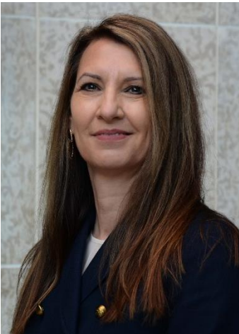
Denise Macza Deputy Minister of Corrections, Policing and Public Safety

Paul Merriman Minister of Corrections, Policing and Public Safety