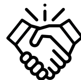
Relationship Building and Dispute Resolution