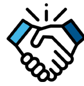
Relationship Building and Dispute Resolution

The TSS Committee will be accepting applications from October 3, 2023, to November 30, 2023.