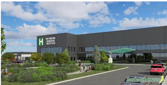
Rendering of the new Weyburn General Hospital

The existing Weyburn General Hospital will be replaced with an integrated facility that includes 25 acute care and 10 in-patient mental health beds. The new Weyburn General Hospital will be owned and operated by the SHA. It will also include an EMS garage and an adjacent heliport to support safer and more efficient patient transport.