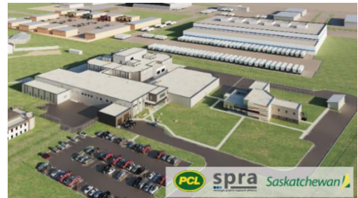
Rendered images of the Remand Centre expansion.