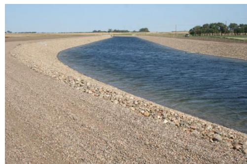
What to expect: Photo of the recently renovated Eastside Canal, east of the Westside Project

The Westside Rehabilitation Project would increase the amount of irrigable land by 80,000 acres in the area. The Westside Expansion Project would see the further expansion and buildout, adding an additional 260,000 acres of irrigable land. The Qu'Appelle South Water Conveyance Project would see the buildout of the Qu'Appelle South Irrigation Project, adding an estimated 120,000 acres of irrigable land.