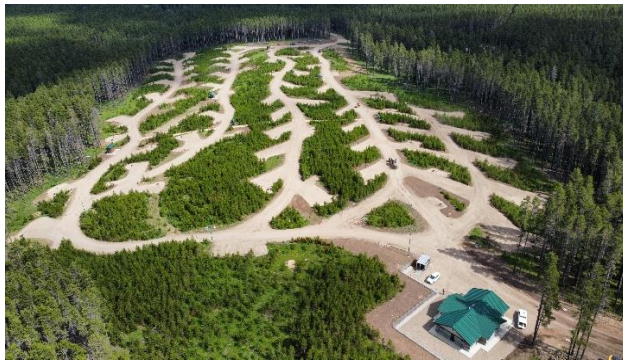
An aerial view of the Pine Hill Campground development, which opened in summer 2022.

Park facility and infrastructure improvements that SBP delivers in collaboration with PCS include: