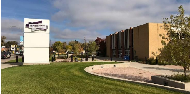
One of the Saskatchewan Polytechnic campuses located in Saskatoon.

Saskatchewan Polytechnic currently delivers post-secondary education programs in 11 locations throughout Saskatoon. SBP is exploring consolidating a campus that will provide programming, training, and administration services within a centralized location.