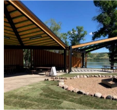
An example of a day-use pavilion.

The Government of Saskatchewan is committed to providing facilities that are safe, accessible, and well-maintained so visitors can enjoy time spent in provincial parks with family and friends.