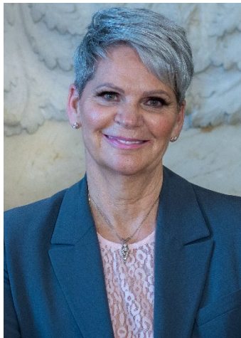
The Honourable Christine Tell Minister of Corrections, Policing and Public Safety

I am pleased to present the Ministry of Corrections, Policing and Public Safety’s business plan for 2023-24.