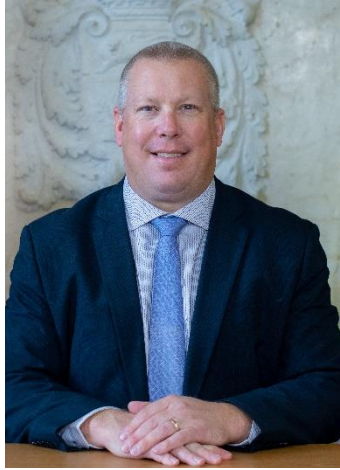
The Honourable Gene Makowsky Minister of Social Services

I am pleased to present the Ministry of Social Services' Business Plan for 2023-24.