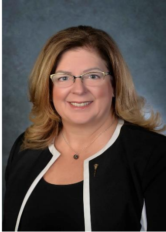
The Honourable Lori Carr Minister of SaskBuilds and Procurement

I am pleased to present the Ministry of SaskBuilds and Procurement Plan for 2023-24.