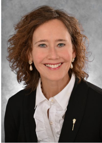
The Honourable Bronwyn Eyre Minister of Justice and Attorney General

I am pleased to present the Ministry of Justice and Attorney General's Business Plan for 2023-24. This plan outlines how we will support the Growth Plan by building safer communities and a stronger Saskatchewan.