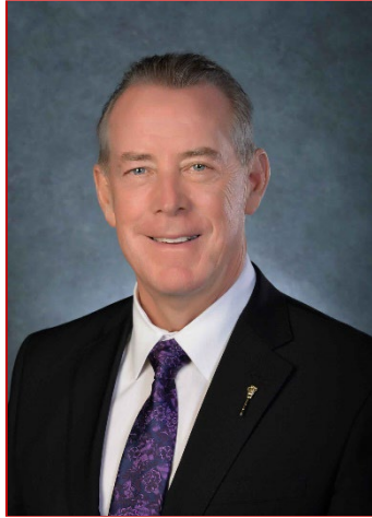
The Honourable Don McMorris Minister of Government Relations Minister Responsible for First Nations, Métis and Northern Affairs Minister Responsible for the Provincial Capital Commission

I am honoured to present the Ministry of Government Relations Business Plan for 2023-24.