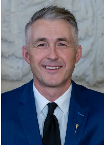
The Honourable Dana Skoropad Ministry of Environment

I am pleased to present the Ministry of Environment Business Plan for 2023-24.