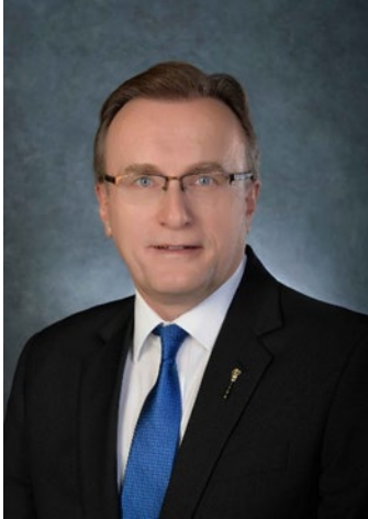
The Honourable Jim Reiter Minister of Energy and Resources

I am pleased to present the 2023-24 Business Plan for the Saskatchewan Ministry of Energy and Resources.