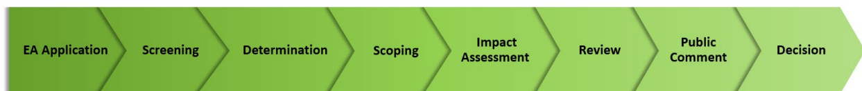
Figure 2. Environmental Assessment Process Overview

Figure 2 outlines the EA process for projects, which are deemed a development and are required to undergo an EIA.