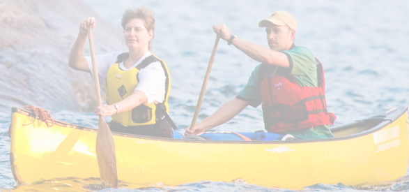
Lac La Ronge Provincial Park; Photo credit: Tourism Saskatchewan/Paul Austring

Saskatchewan is committed to broadening its training and education system to build workforce stability to meet the unique and long-term needs of our provincial health system.