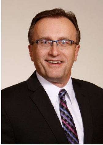
The Honourable Jim Reiter Minister of SaskBuilds and Procurement

I am pleased to present the Ministry of SaskBuilds and Procurement Plan for 2022-23.