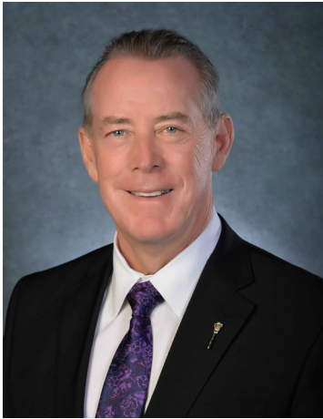
The Honourable Don McMorris Minister of Government Relations Minister Responsible for First Nations, Métis, and Northern Affairs Minister Responsible for the Provincial Capital Commission

I am pleased to present the Ministry of Government Relations Business Plan for 2022-23.