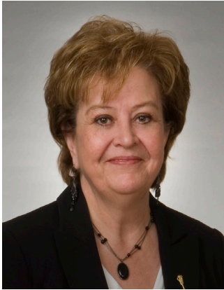
The Honourable Donna Harpauer Deputy Premier and Minister of Finance

I am pleased to present the Ministry of Finance Business Plan for 2022-23.