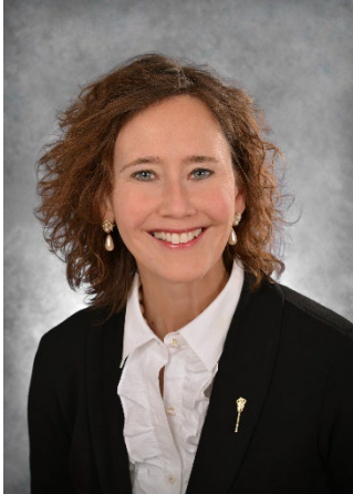
The Honourable Bronwyn Eyre Minister of Energy and Resources

I am pleased to present the 2022-23 Business Plan for the Saskatchewan Ministry of Energy and Resources (ER).