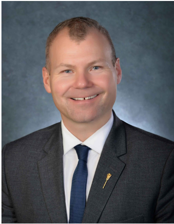
The Honourable Dustin Duncan Minister of Education

I am pleased to present the 2022-23 Ministry of Education Business Plan to keep Saskatchewan classrooms, child care facilities, libraries and literacy programs On Track .