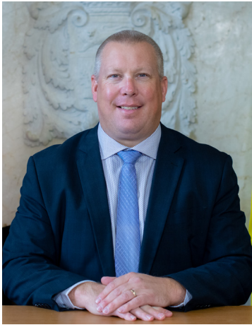
The Honourable Gene Makowsky Minister of Advanced Education

I am pleased to present the Ministry of Advanced Education Plan for 2022-23.