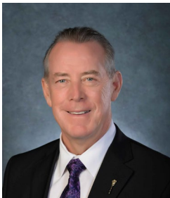
The Honourable Don McMorris Minister of Government Relations Minister Responsible for the First Nations, Métis & Northern Affairs Minister Responsible for the Provincial Capital Commission

I am pleased to present the Provincial Capital Commission Plan for 2021-22.