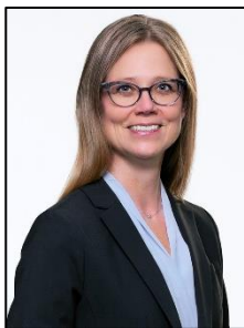
Susanna Laaksonen-Craig Deputy Minister of Energy and Resources

The Honourable Bronwyn Eyre Minister of Energy and Resources