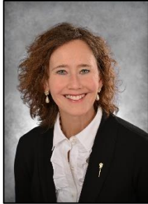
The Honourable Bronwyn Eyre Minister of Energy and Resources

Office of the Lieutenant Governor of Saskatchewan