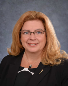
The Honourable Lori Carr Minister of Social Services

I am pleased to present the Ministry of Social Services' Plan for 2021-22.