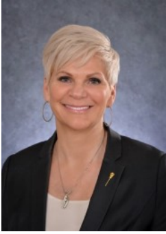
The Honourable Christine Tell Minister of Corrections, Policing and Public Safety

I am pleased to present the Ministry of Corrections, Policing and Public Safety's Plan for 2021-22.