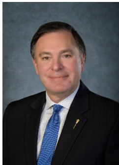
The Honourable Gordon Wyant, Q.C. Minister of Justice and Attorney General

I am pleased to present the Ministry of Justice and Attorney General's Plan for 2021-22.