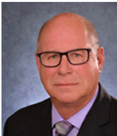
The Honourable Fred Bradshaw Minister of Highways

I am pleased to present the Ministry of Highways Plan for 2021-22.