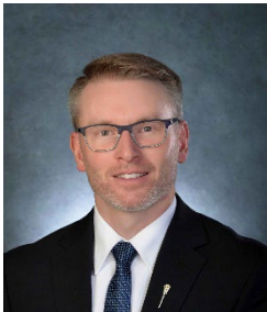
The Honourable Everett Hindley Minister of Mental Health and Addictions, Seniors, and Rural and Remote Health

We are pleased to present the Ministry of Health's 2021-22 Plan.