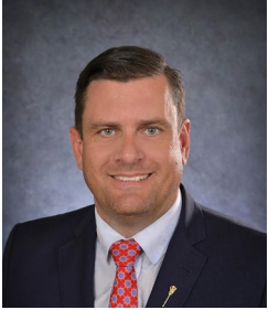
The Honourable Paul Merriman Minister of Health