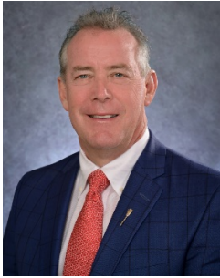
The Honourable Don McMorris

Minister of Government Relations Minister Responsible for First Nations, Métis, and Northern Affairs Minister Responsible for the Provincial Capital Commission