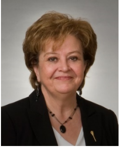
The Honourable Donna Harpauer Deputy Premier and Minister of Finance

I am pleased to present the Ministry of Finance Plan for 2021-22.