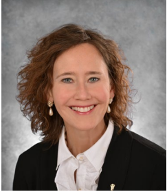
The Honourable Bronwyn Eyre Minister of Energy and Resources

I am pleased to present the 2021-22 Operational Plan for the Saskatchewan Ministry of Energy and Resources (ER).