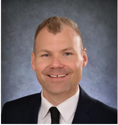
The Honourable Dustin Duncan Minister of Education

I am pleased to present the Ministry of Education Plan for 2021-22.