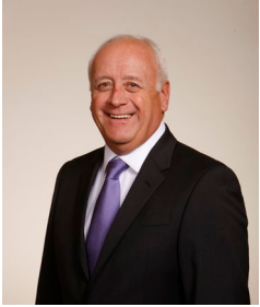
The Honourable David Marit Minister of Agriculture

I am pleased to present the Ministry of Agriculture's Operational Plan for 2021-22.