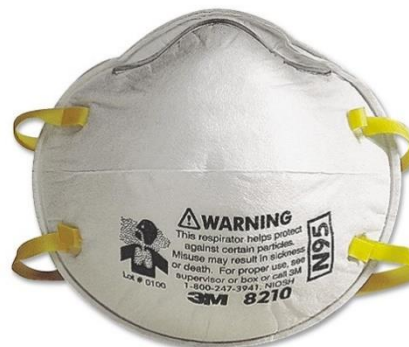
Right: N95 respirator

N95 respirators are an approved (e.g. NIOSH) air-purifying, particulate-filtering, disposable, half-face piece respirator. These devices are designed to protect users from inhaling hazardous airborne particles and aerosols, including dusts and infection agents such as the COVID-19 virus. The protective devices are common protective in health care settings and require initial and ongoing training, as well as an approved method for fit-testing to ensure a tight facial seal. Without this training and fit-testing, they may not be effectively protect against the COVID-19 virus.