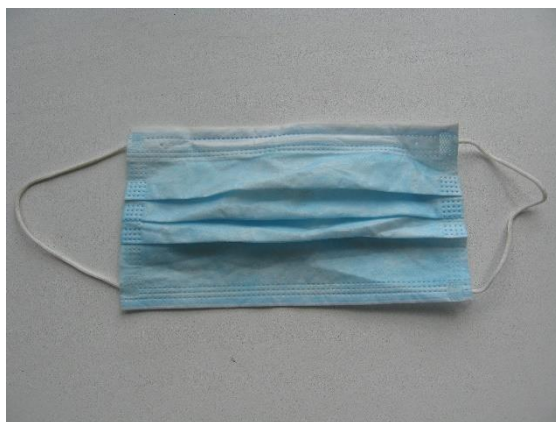
Left: Surgical/procedure mask.