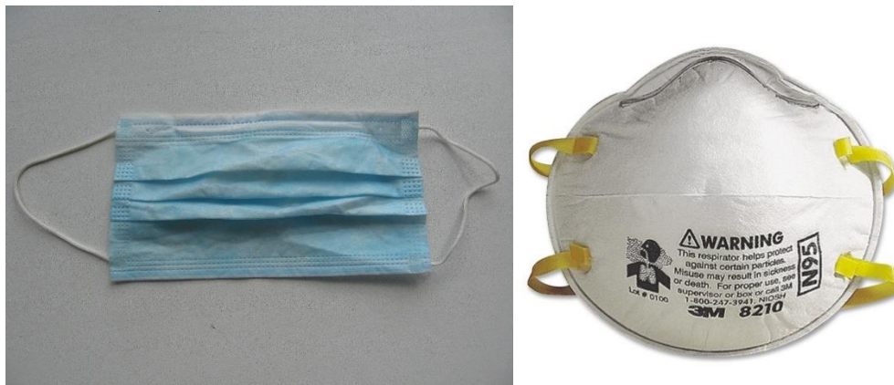
Left: Surgical/procedure mask. Right: N95 respirator