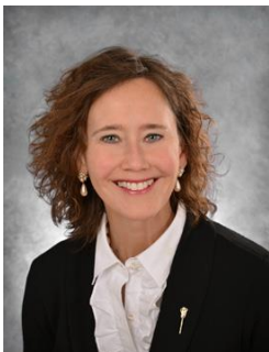
The Honourable Bronwyn Eyre Minister of Energy and Resources

Office of the Lieutenant Governor of Saskatchewan