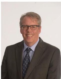
Doug MacKnight A/Deputy Minister of Energy and Resources

The Honourable Bronwyn Eyre Minister of Energy and Resources