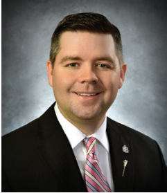
The Honourable Jeremy Harrison Minister of Immigration and Career Training

I am pleased to present the Ministry of Immigration and Career Training Operational Plan for 2020-21.