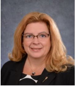
The Honourable Lori Carr

Minister of Government Relations and Minister Responsible for First Nations, Métis and Northern Affairs