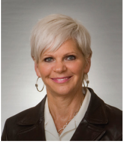
The Honourable Christine Tell Minister of Corrections and Policing

I am pleased to present the Ministry of Corrections and Policing's Plan for 2020-21.