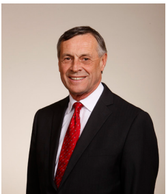
The Honourable Don Morgan, Q.C. Minister of Justice and Attorney General

Christine Tell Minister of Corrections and Policing