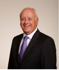
The Honourable David Marit Minister of Agriculture

I am pleased to present the Ministry of Agriculture's Operational Plan for 2020-21.